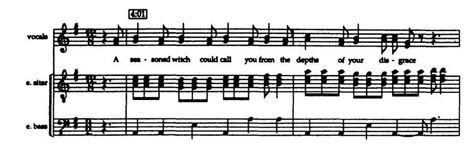
Example 1.2. Polymetric scheme between parts in A-section verse

terms of polymeter and is much more likely to hear the first verse in 3/2; consequently, the listener will perhaps interpret the rhythmic figures in the electric sitar and vocals as highly syncopated within the metric context of 3/2.