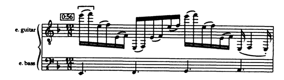
Example 1.5. E-F motive in the introduction

The preceding discussion has suggested that "Close to the Edge" falls basically into a four-part scheme. This scheme is supported by the return of the A sections and the presence of a contrasting B section and can be seen to refer back to rock song form through the use of strophic verse and chorus (or refrain). The use of bridge material to extend the verse sections is also traceable to rock sources.<sup>39</sup> In addition, the overall A A' B A" scheme can be traced back to the thirty-two-bar song form found in so many Tin Pan Alley tunes.<sup>40</sup> But it is also possible to detect features of an overarching two-part design, with the second section beginning at what I have labeled B in figure 1.1; and thinking of this piece in terms of a large two-part structure makes possible the further extension of the preceding argument suggesting the working out of a large-scale strategy. This two-part formal perspective hinges on interpreting the second part of the song as constituting, to some degree, a recomposition of the first part. In order to support that view, one must view the B