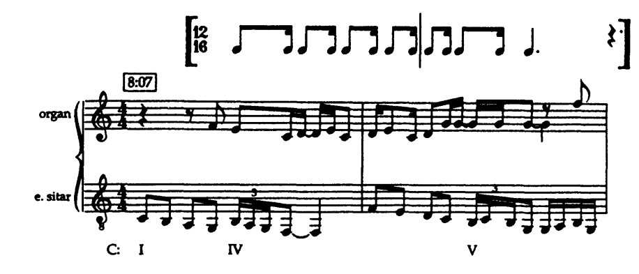
Example 1.1. "Close to the Edge" fugato

Figure 1.1 interprets the overall formal design of "Close to the Edge" as falling generally into a four-part scheme, with two large A sections followed by a contrasting B section and a return of the A section. Each A section begins with what I have designated an A-dorian verse; the final A section has two verse passages of structural importance. These verse passages begin at 3:54, 6:03, 14:59, and 15:53. Before considering these verses further, however, it may be helpful to address my use of the phrase "dorian mode." In using this term to describe the tonality of these passages, I am mostly prompted by a desire to avoid viewing the harmonic activity in the verse against the model of the traditional major-minor system (see fig. 1.2). According to the traditional model derived from common-practice-period European art music,