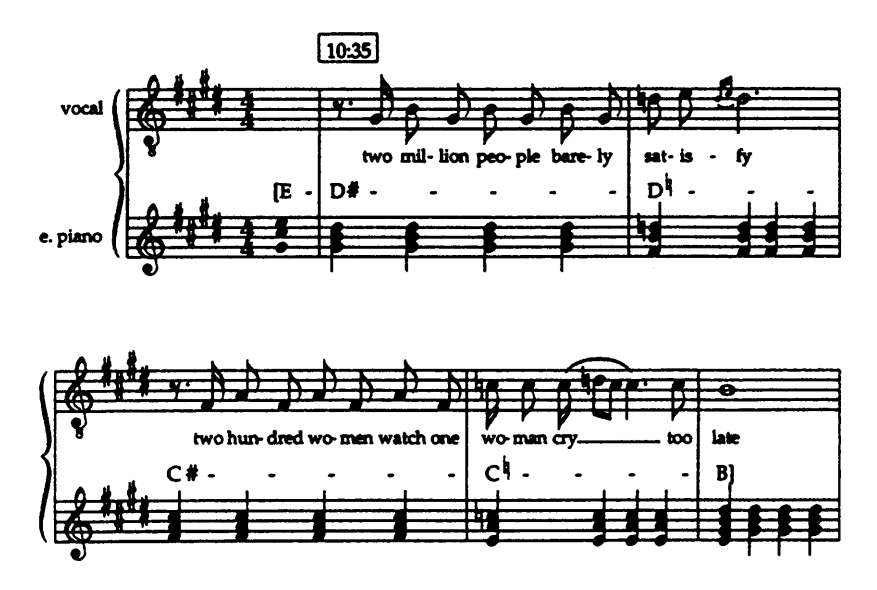
Example 1.12. Filled-in fourth motive in the B-section verse

In terms of formal design, the B section can thus be seen to be a reworking of the introduction in an additional way to the ones described earlier in this chapter: the B section is a reinterpretation of the introduction in terms of an idea that is central to