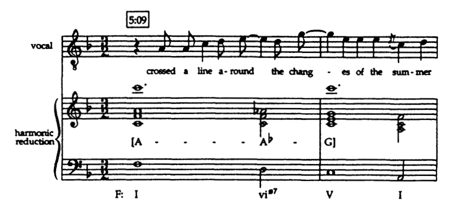
Example 1.10. A-Ab-G motive in the A-section bridge

and, as was discussed earlier, a certain amount of rhythmic and metric tension is present (see ex. 1.2). The bridge sections, by contrast, are in major keys (though in different keys at each appearance), with a far more conventional melodic contour in the voice; there is no unusual rhythmic tension, and the harmonic progression suggests that traditional voice leading is operative (see ex. 1.10). One could, then, view the verse as in some way capturing a kind of chaotic and perhaps primitive material realm, while the bridge stands for a more refined and even more life-affirming spiritual realm. The lyrics in these sections tend to reinforce this interpretation; consider, for instance, the following lyrics from the A-section verse: