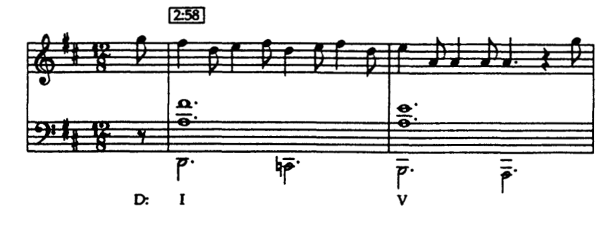
Example 1.9. "Close to Edge" theme in the introduction

the second A section. The metric analysis presented earlier tends to support this reading of the final A section: the instrumental verses correspond metrically to the first A section, and the vocal verses correspond to the second section.