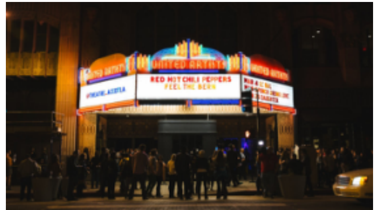
RHCP "Feel the Bern" Campaign Show

Risky because RHCP could potentially lose fans, but lots of people showed up and Bernie's messages were delivered and highly accepted by the crowd.